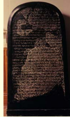
This Moabite inscription, the "Mesha Stela" commemorates Mesha's revolt against Israel