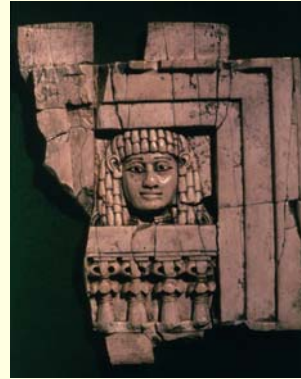
This ivory carving depicts an Israelite woman of the period looking out a window. Jezebel looked out an upper window at Jehu before she was thrown to her death.