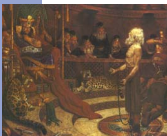
Abinadi before King Noah