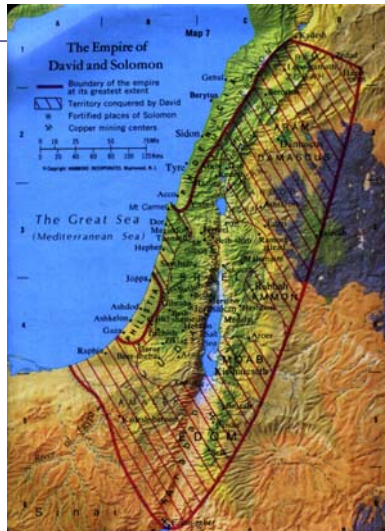
United Kingdom of Israel under David 10/11/2006

(see Assyria and Babylon maps in packet)