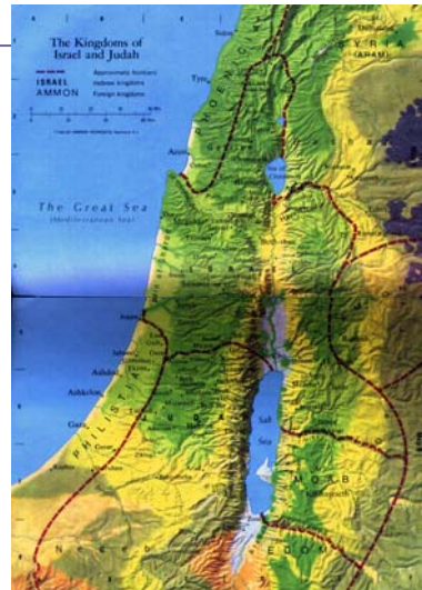
Divided Kingdom: Israel (Ephraim) in the north and Judah in the south 12b. Nephi's Discourse 1 (2 Nephi 11-15)